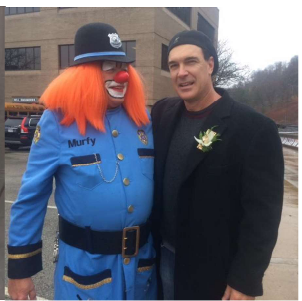
Before parade with Seinfeld's Patrick Warburton

From the Sulkoskys We have sold our home in Durango West and purchased a single level home near Bayfield, only about 25 miles away. It has 4 bedrooms and an office, 3 bathrooms, and a 2-car garage. The stairs were just getting to be too much. We had an offer less than 2 weeks after we put it on the market, and found our new home, so everything went very quickly. We just moved in last weekend, and although we are moved in, we are far from settled in. That will take quite a bit longer!