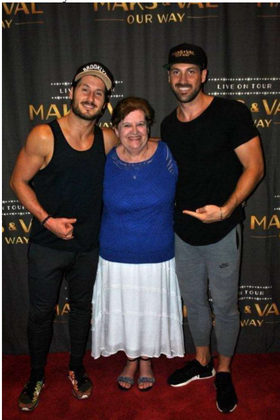
A Great Image