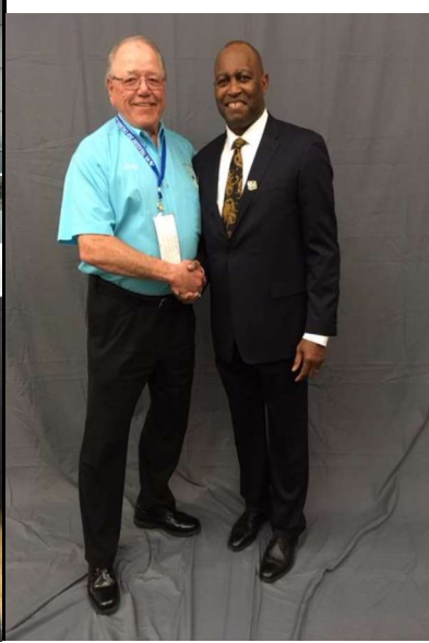
Meeting Judge Dwayne Woodruff